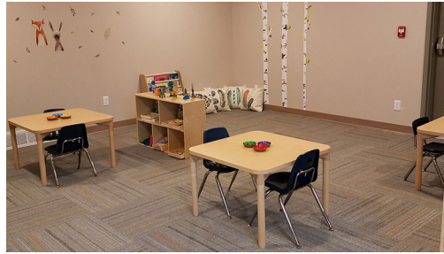
Great Bear Childcare